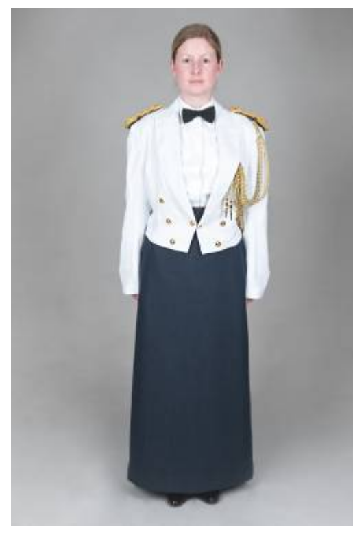
No 11a Concert Dress Warm Weather Areas