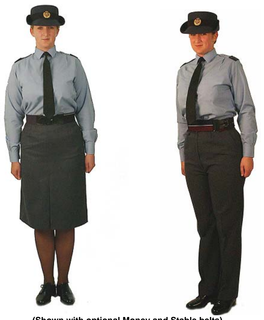
(Shown with optional Money and Stable belts)