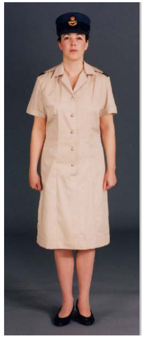
No 6 Frock Note: this dress has black buttons not anodised as shown above