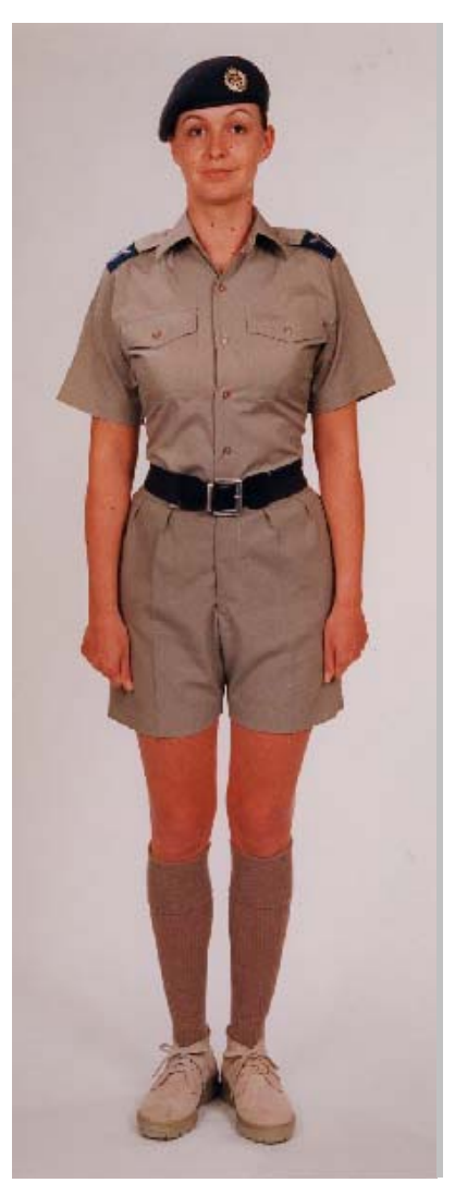
7B Working Dress - Shorts