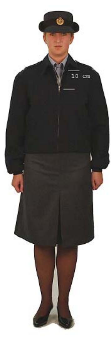
GPJ – With No 2B