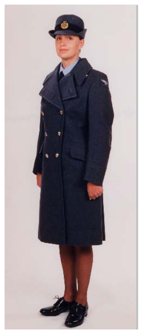
FS & Below