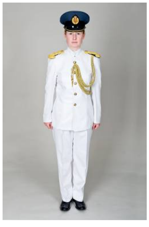
No 11 Ceremonial Parade Dress Warm Weather Areas