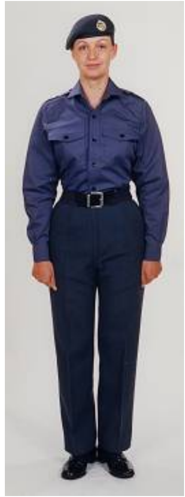
Shown with 'optional' Money Belt