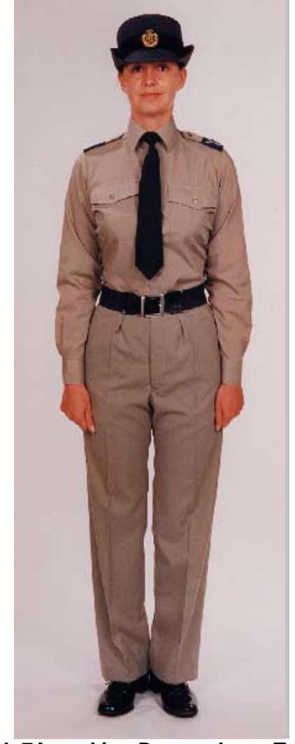
No7A working Dress - Long Trousers