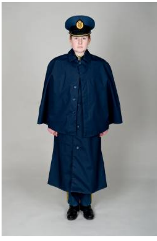
Musician with Cape